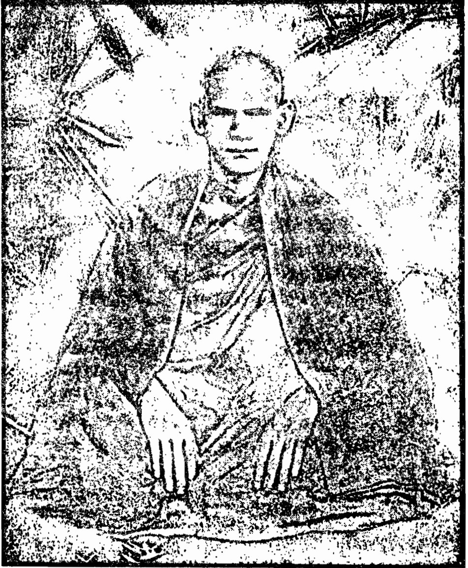
The Venerable Mahāsi Sayādaw, Bhadanta Sobhana Mahāthera, Aggamahāpāṇḍita.